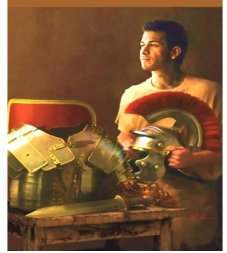
Adult Sabbath School Bible Study Guide Third Quarter 2023

July 1st will be the first Sabbath of the third quarter of 2023. During the third quarter (July, August and September), the adults will use the Bible Study Guide entitled "Ephesians."